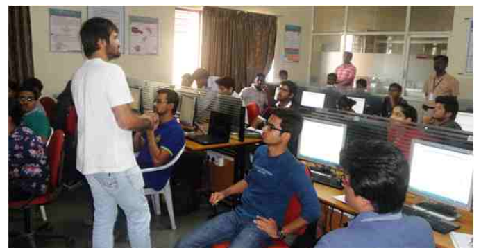
One week workshop on 'MATLAB' was organized by MESA on 23rd – 27th Feb 2015. This workshop was organized by the students for the students. 38 students participated in this workshop.