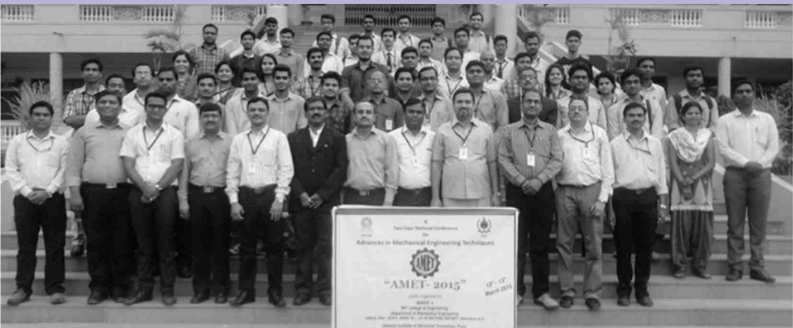
2 Day National Conference on 'Advances in Mechanical Engineering Techniques (AMET) – 2015' was organized by the department jointly with Defence Institute of Advanced Technology (DIAT), Pune, on 12th – 13th March 2015. 160 students from different colleges and industries were participated. 80 participants presented and published their paper at conference.