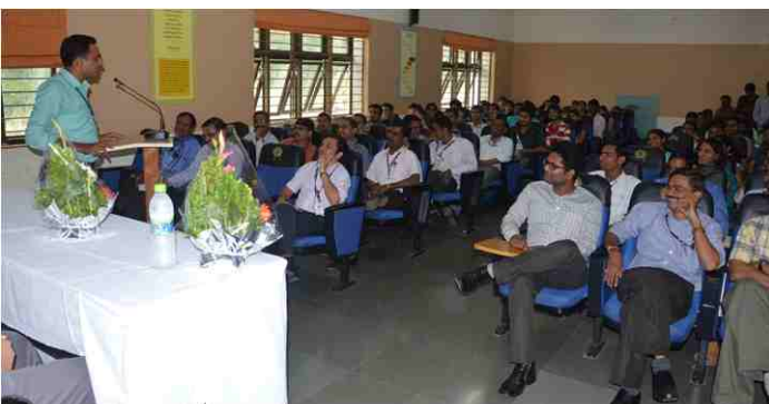
Mechaical Engineering Students Association (MESA) celebrated the 'Teachers Day' on 5th September 2014.