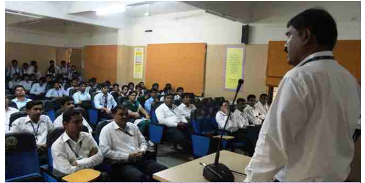
Mechaical Engineering Students Association (MESA) celebrated the 'Engineers Day' on 15th September 2014. MESA organized quiz & competition on the occasion of Engineers Day