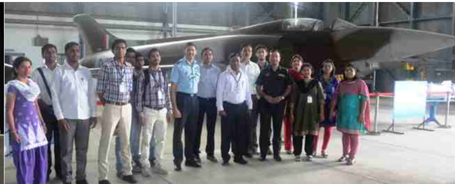
Visit to DIAT during AMET-2015.