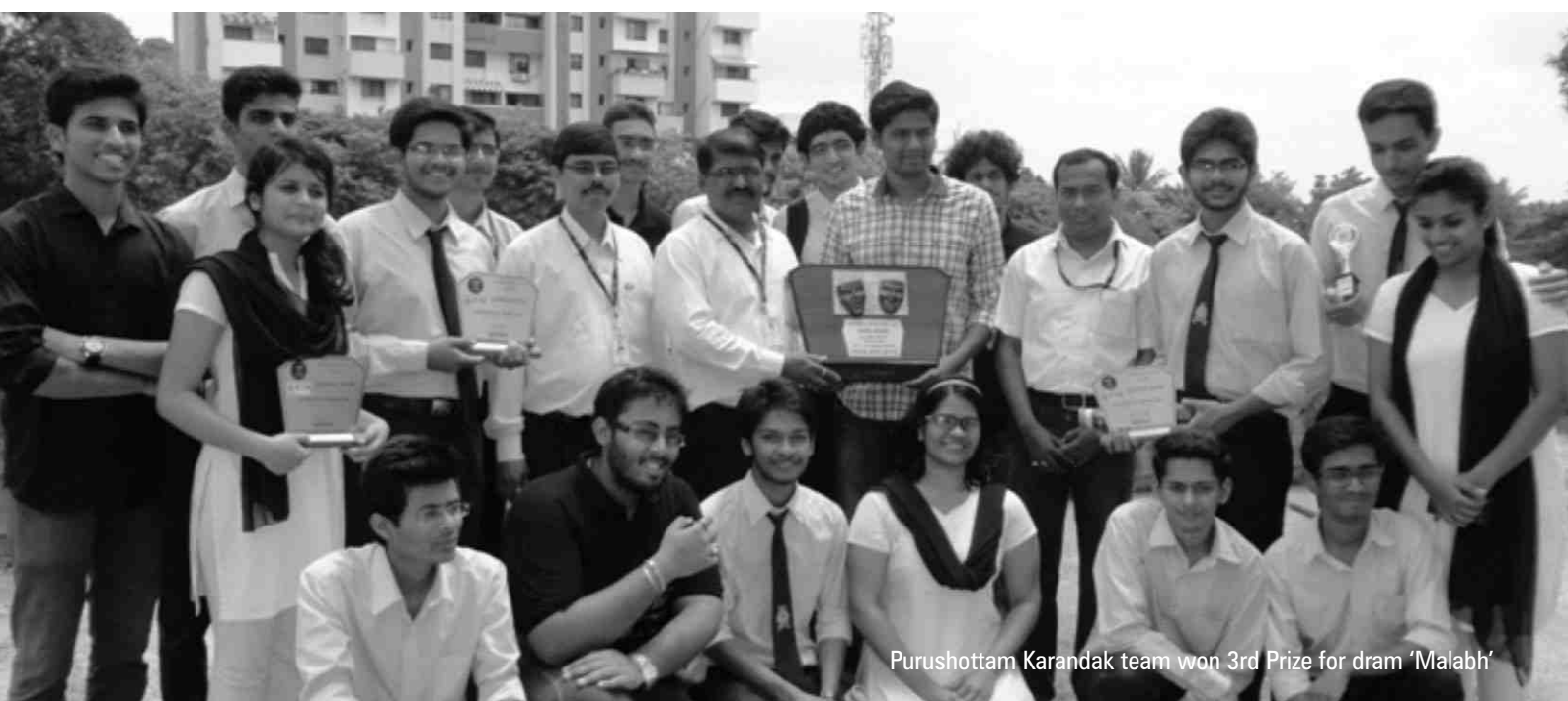
Purushottam Karandak team won 3rd Prize for dram 'Malabh'