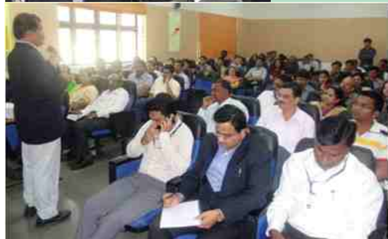
Parent Meet Semester – II (27th February 2015) Parent Meet was organized by the department on 14th August 2014 (Semester-I) & 27th February 2015 (Semester-II)