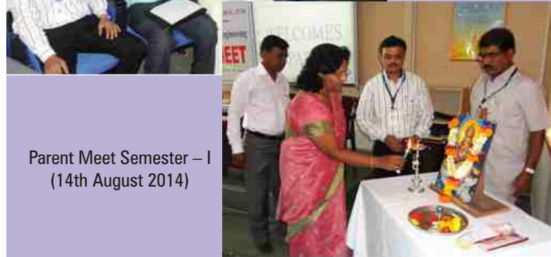
Parent Meet Semester – I (14th August 2014)