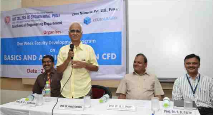
One Week FDP on 'Basics and Applications of the CFD' was organized by the department in association with ZEUS Numerix Pvt. Ltd., Pune, from 2nd to 6th February 2015. Most of the speakers for the FDP were from IIT, Mumbai. 70 participants had attended this FDP.